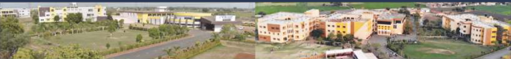
Vikrant Group of Institutions GWALIOR CAMPUS

To make Vikrant Group of Institutions the center of excellence and catapult its students to a path leading to the pinnacle of success, as well as groom them as future visionaries and entrepreneurs.