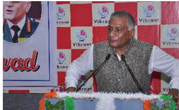
Hon'ble Gen. V.K. Singh Ji, (Retd.) Chief of Indian Army Staff Minister of State (Road Transport & Highways), Govt. of India