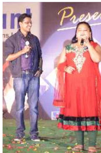
Bharti Singh Comedian