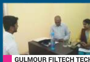
GULMOUR FILTECH TECH