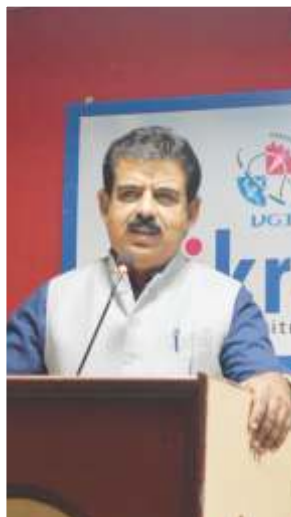
Hon MP Shankar Lalwani