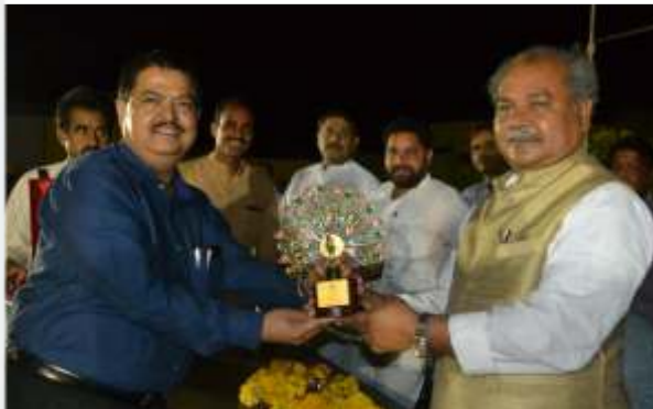
Shri Narendra Singh Tomar ji Hon'ble Minister For Rural Development, Agriculture & Farmers Welfare Department, Govt. of India