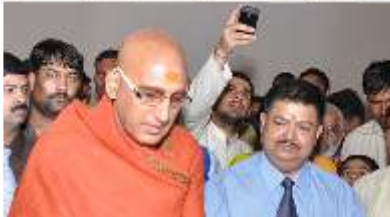
Shri Avdheshanand ji Maharaj Mahamandlashwar Shri Shri 1008