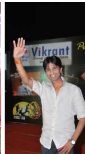
Dr. Kumar Vishwas Renowned Indian Poet