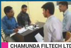
CHAMUNDA FILTECH LTD