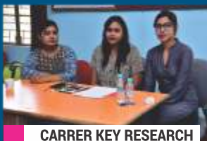
CARRER KEY RESEARCH